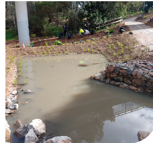
Basin site – looking west. The ephemeral stormwater retention basin with students from Pulteney Grammar School assisting staff with planting local native species. Tree guards from other local native revegetation plantings can be seen in the background. At the project’s completion, all the bare/grass ground will be planted with local native species.

City of Adelaide with funding support from Green Adelaide, delivered an urban address and gateway at Hackney Road Bridge. A small 50m 2 stormwater retention basin and approximately 1,200m 2 of Park Lands was revegetated with over 5,000 local native plants to improve water quality and attract local biodiversity such as woodland birds and native bees. Interpretive signs on Water Sensitive Urban Design have been installed at the basin’s edge and a directional sign at the intersection of three paths provides information recognising Kaurna cultural heritage and the River Red Gum Woodland.