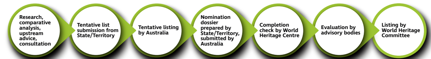
Figure 1: Work plan to progress through the World Heritage Bid, the project is currently at step 1.

Over the last financial year progress was made on preparation of a nomination to seek World Heritage listing for Adelaide and its Rural Settlement Landscapes, which includes the area of the Adelaide Park Lands. The project team that includes City of Adelaide, Department of Environment and Water, and Mount Lofty Ranges Group of Councils, have developed a work plan to progress through the project. The nomination is an opportunity to recognise the systematic colonial settlement model, including the impact of settlement on Aboriginal people. Truth-telling and reconciliation are an important and necessary part of the nomination. The designation will recognise the nominated area as a living landscape that will change and evolve over time whilst ensuring the heritage values are respected for present and future generations. Figure 1 below shows the project is at the initial stage of the nomination process.