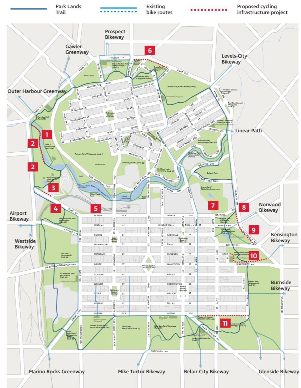
Figure 2: Map of the Cycling Infrastructure Projects in the Adelaide Park Lands.