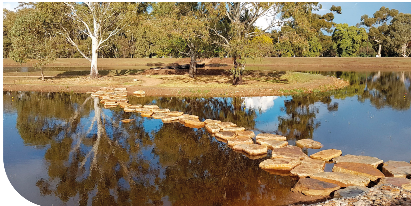
Opening day of the wetlands in Victoria Park/Pakapakanthi (Park 16). Shown here are the steppingstone bridge across the wetlands to a path through a collection of regulated trees and a bridge to the southwestern bank of the wetlands (Beaumont Road is behind the bank).

Kadaltilla has a responsibility to provide advice on policy, development, heritage or management issues affecting the Adelaide Park Lands. This advice can be provided on the basis of any request or on its own initiative. At its meeting in February 2022, in response to a request from Council, Kadaltilla supported the commencement of a Master Plan for Victoria Park/Pakapakanthi (Park 16) to enhance the environmental qualities of the park. Development of the master plan began in May 2022.